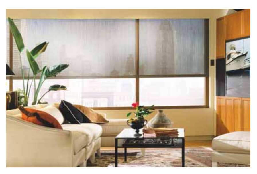
The easy-to-operate manual MechoShades® with transparent shadecloth

Robust hardware and extensive windowcovering solutions