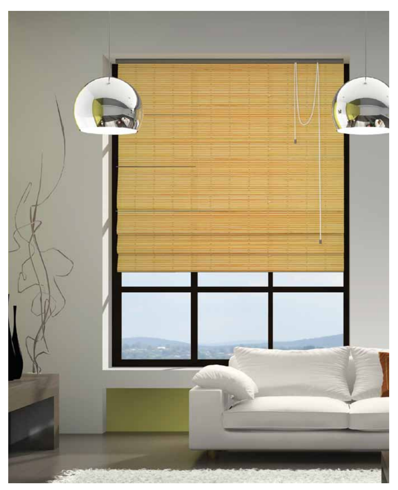
A roman shade from the exotic Woven Woods and Grasses collection