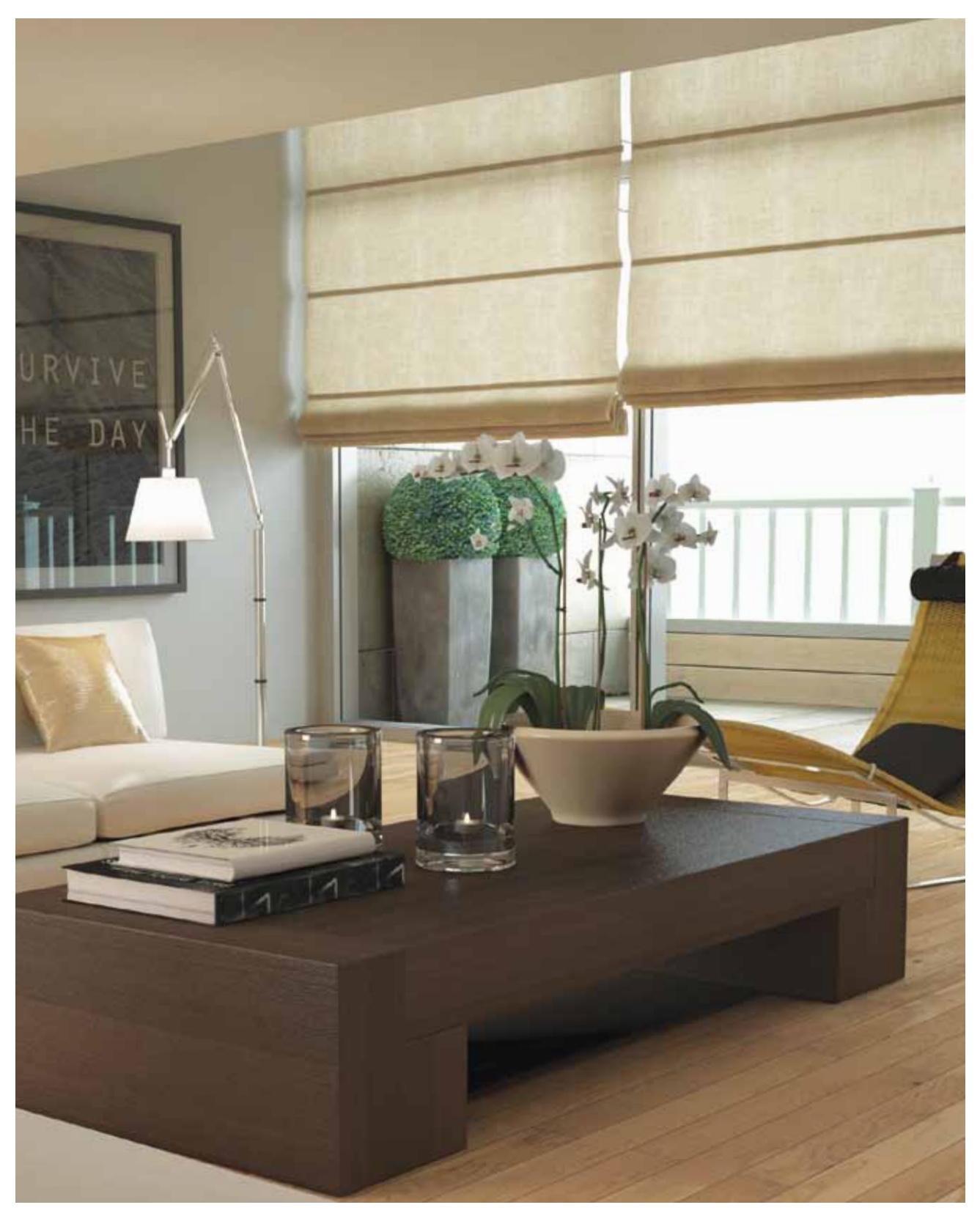
Elegant manual or motorized roman shades