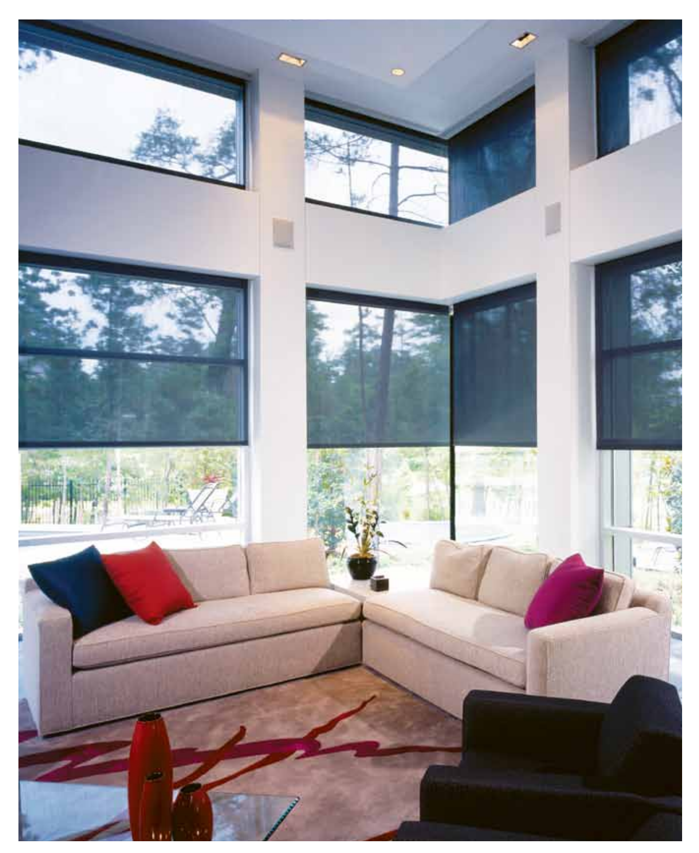
Group-controlled ElectroShades® with 5% open-weave shadecloth