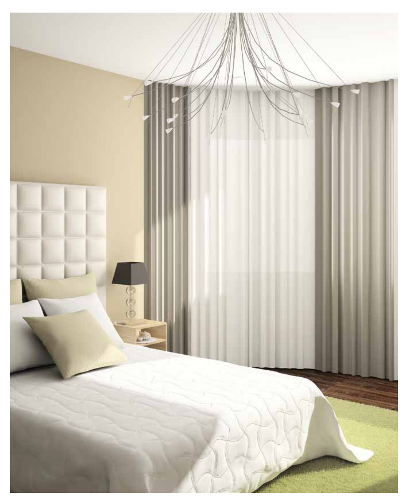
WhisperTrac® motorized drapery-track systems, configured with straight or curved tracks